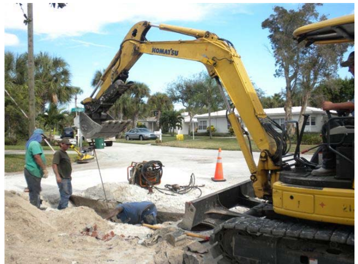
Atlantic Development of Cocoa replaces a section of failing metal storm drainage pipe under S. Shannon Avenue at Ninth Avenue

Vinnielu's Beachside Chocolates - 866 N. Miramar - confectionary retail