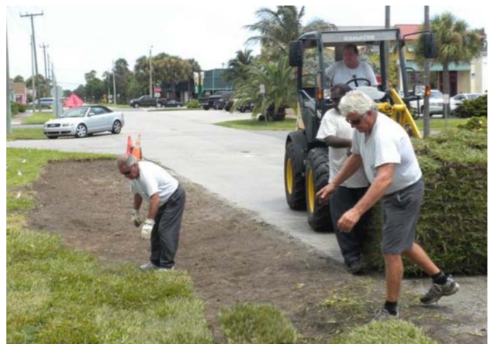
Public Works personnel lay sod after forming a swale in the street right-of-way on S. Palm Avenue. Swales are a commonly used stormwater practice recommended by federal and state officials to treat runoff to reduce pollution.