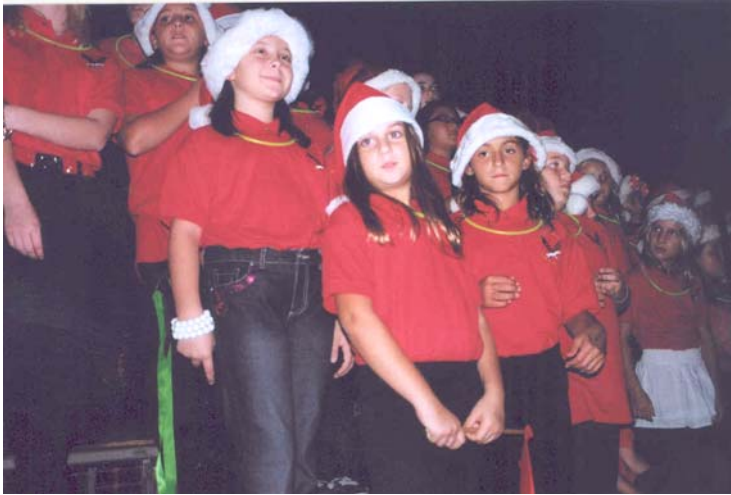
The Indialantic Elementary Chorus spread cheer at the annual Tree Lighting ceremony in Nance Park. Santa arrived in the Town fire truck spreading joy and cookies to all.