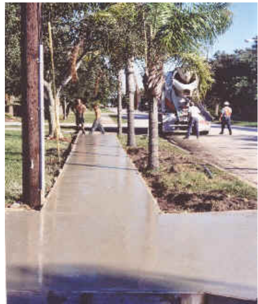
Don Bo, Inc. employees install sections of sidewalk on Fourth and N. Ramona avenues. Missing sidewalk links were added along the south side of Fourth Avenue east of N. Ramona Avenue and included sections along the west side of N. Ramona Avenue north and south of Fourth Avenue. The Town covered the $13,291 cost from the Transportation Impact Fee Trust fund.