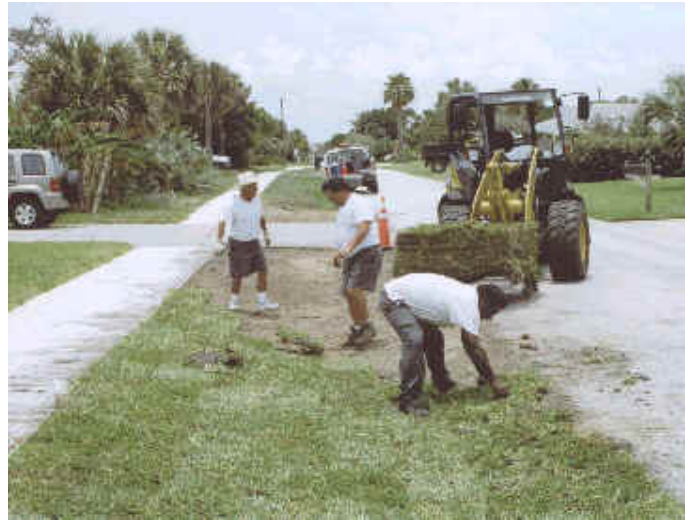
Public Works personnel install a swale at 125 Eighth Avenue