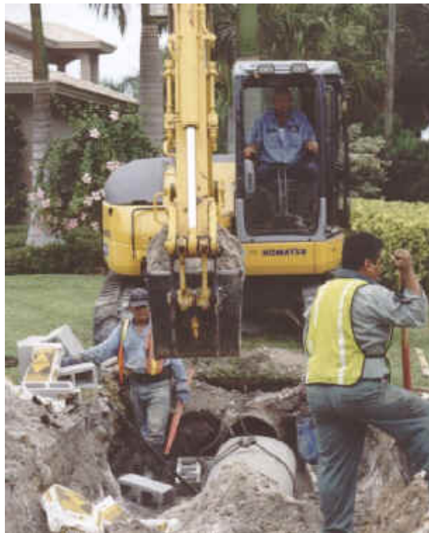
Atlantic Development of Cocoa, Inc. replaces the failing metal stormwater pipe at 1105 S. Riverside Dr. The Town has approximately 38,000 linear feet of 45 year old metal pipe that needs to be replaced.