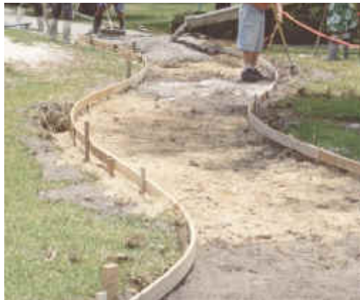
Don Bo, Inc. installs a sidewalk around the play area in Orlando Park