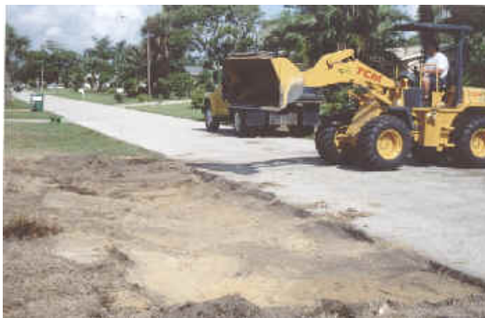
Town Public Works personnel continue efforts to capture water run-off in street side swales. This swale was installed recently on Eighth Avenue